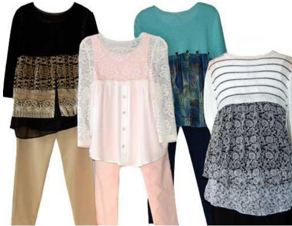
Back view of garments! (The fronts are knit.)

You will have so much fun making these one-of-a-kind tops!